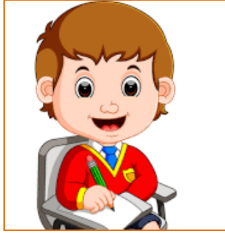
Photograph of student